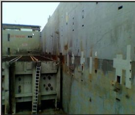
One of sixteen 25-ton heat exchanger units on a heavy lift vessel in New Haven, CT