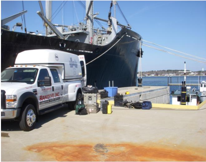
Completing the bow area

Randive, Inc. was awarded a contract to perform a survey on the T/S KENNEDY in order to synchronize their ABS & USCG in-water surveys. In order to perform the required inspection the work was needed to be per-