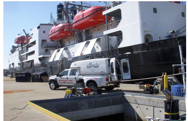
Diving operations set-up on the bow of the T/S "KENNEDY"

complete the survey, was performed on Thursday the April 16th. All work was performed to the satisfaction of all interested parties and well within the allocated budget and timeline.