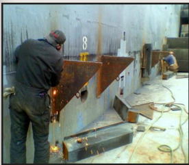
Burning off cargo brackets for 25-ton heat exchanger units on a heavy lift vessel in New Haven, CT